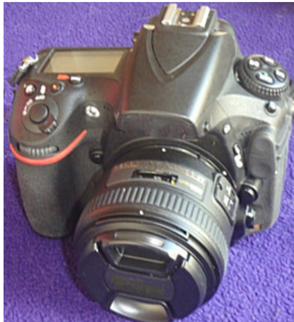
Figure 3: DSLR Camera

Dedicated Digital Single-Lens Reflex (DSLR) cameras like the one pictured in Figure 3, below produce superior pictures. These cameras employ a mechanical shutter to switch from the user viewing the scene to the camera actually capturing the picture. This normally provides for higher resolution and lower noise (imperfect capture) due to not sharing the duties of capture and driving the viewfinder.