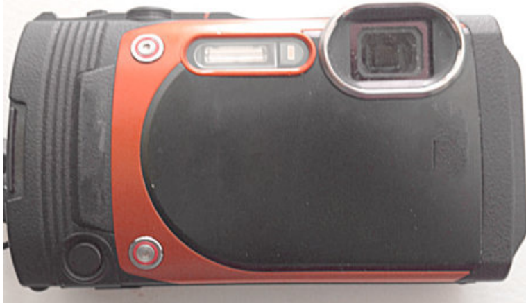
Figure 2: Point-and-Shoot Camera

Dedicated Digital Single-Lens Reflex (DSLR) cameras like the one pictured in Figure 3, below produce superior pictures. These cameras employ a mechanical shutter to switch from the user viewing the scene to the camera actually capturing the picture. This normally provides for higher resolution and lower noise (imperfect capture) due to not sharing the duties of capture and driving the viewfinder.